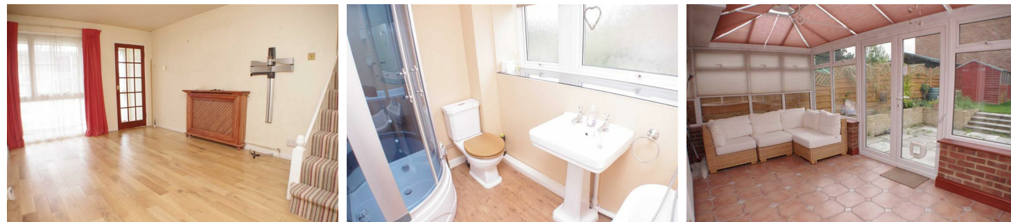
Ground Floor Approx. 62.2 sq. metres (670.0 sq. feet)

Set in a delightful cul-de-sac is this impressive bright and spacious three bedroom semi-detached family home with a garage. This home has been tastefully decorated throughout and enjoys an entrance hall, living room, kitchen/breakfast room and conservatory to rear. Gresford Close is conveniently located on the northeast side of the city close to many highly regarded schools to include Beaumont. The main city centre with its wide range of shopping and leisure facilities is only a short drive away. The property also provides good access to the motorway link roads. Offered for sale with no upper chain.